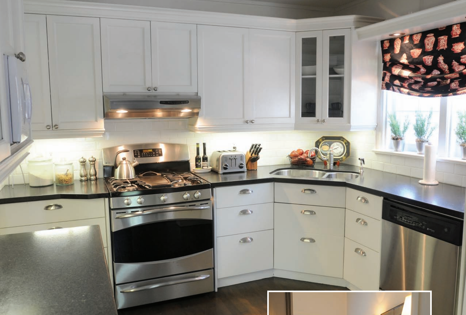
Suzanne Tait's white and stainless steel kitchen gets a little burst of colour from the window covering and pots of plants lined up along the sill. At right, the bathroom maintains traditional elements in its wall tiles, pedestal sinks and mosaic inset in the tile floor.